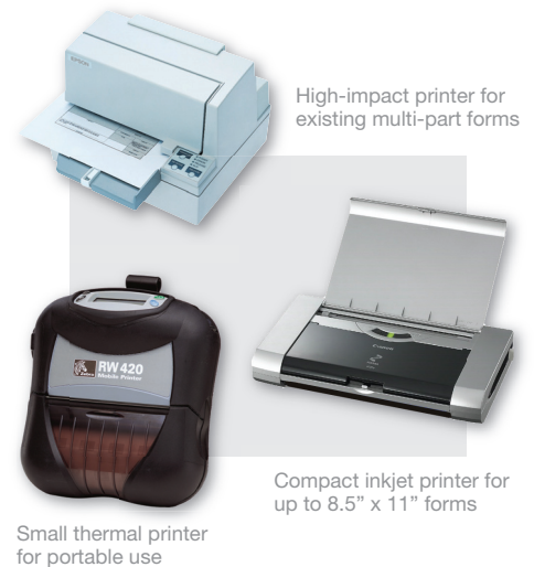
High-impact printer for existing multi-part forms